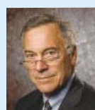
Steve H. Hanke Professor of Applied Economics The Johns Hopkins University