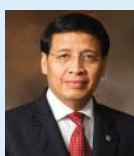
N. Hassan Wirajuda Member of Presidential Advisory Council (Dewan Pertimbangan Presiden) Republic of Indonesia